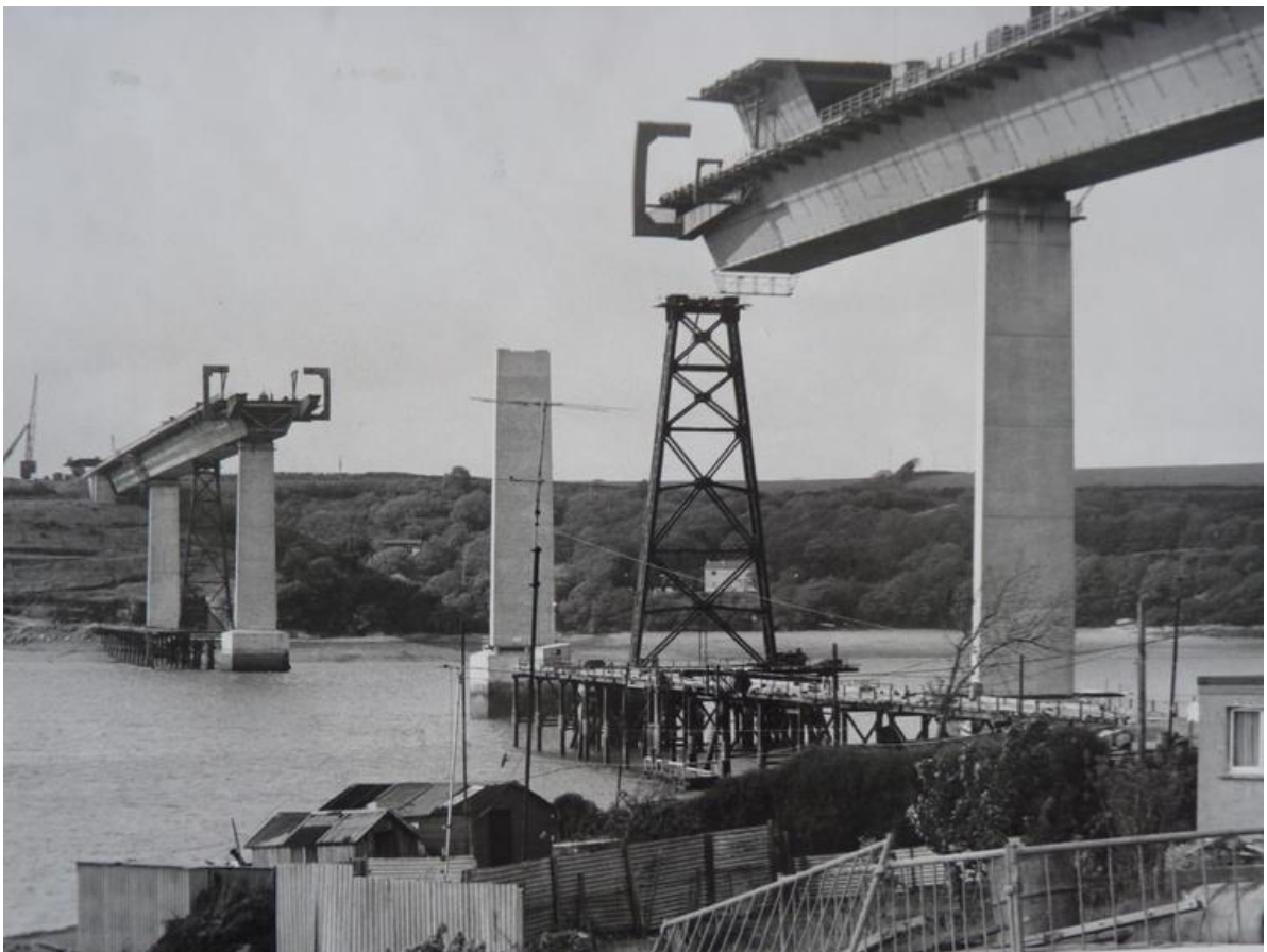
Taken when construction re-started in 1972