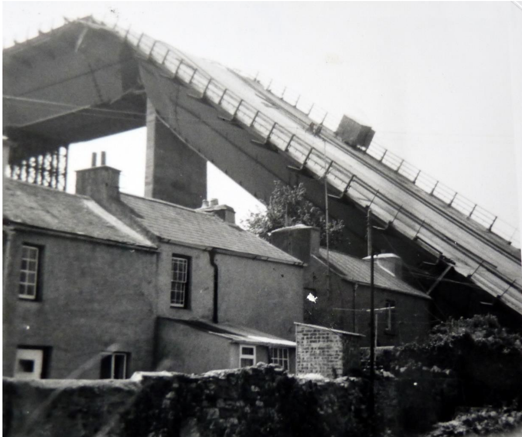
The steel section came within a few feet of landing on houses