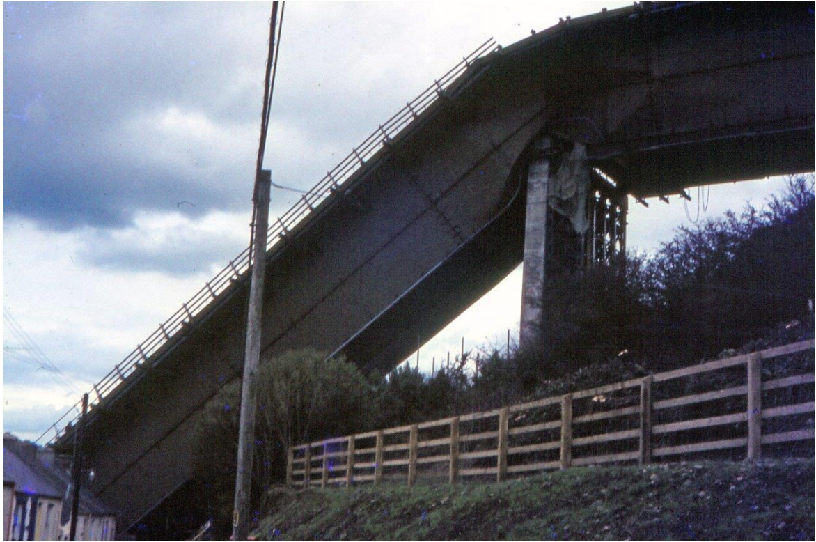
Some idea of the size of the steel box section