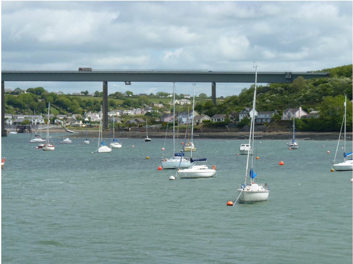
The Cleddau Bridge today – Pembroke Ferry on the right